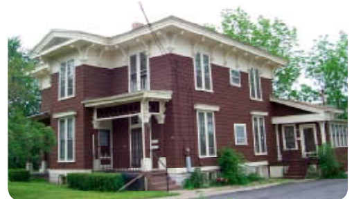
West Bayard Street

Almost all Italianate houses feature a single-story porch extending the full width of the façade or covering just the front entry. Single or paired doors may